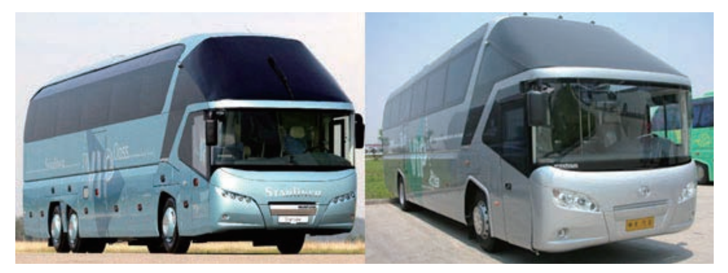
Figure 5. The contested bus design.