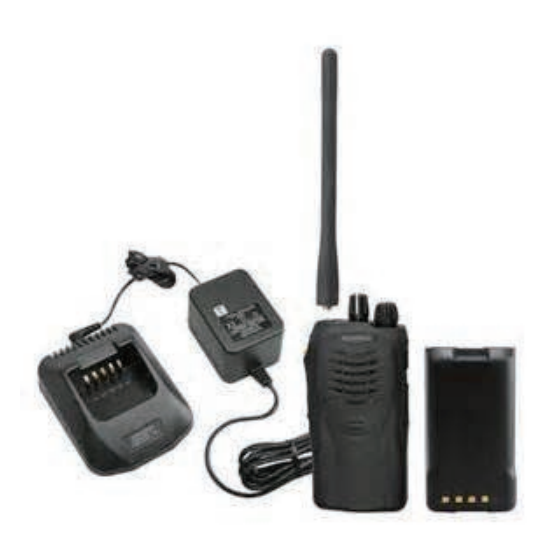
Figure 4. KENWOOD has successfully enforced its design patents with regard to radio equipment TK-278/378 and TK-2160/3160 against Chinese infringers.

In order to seek damages a design patent holder can enforce their IPR through the relevant courts. Although a court case may be expected to be lengthy and costly, a design patent has some advantage over other patent types. A design patent infringement is indicated by a visual comparison between figures of the design patent and the infringing products, which is easier than determining infringement in an invention patent case. This means that the enforcement of a design patent has certain advantages including faster proceedings, lower costs and higher level of certainty of the outcome due to the fact it is easier for the Chinese People's Court to accept and handle design patent cases. Companies such as Kenwood have experienced success in China in enforcing their design patents through the courts.