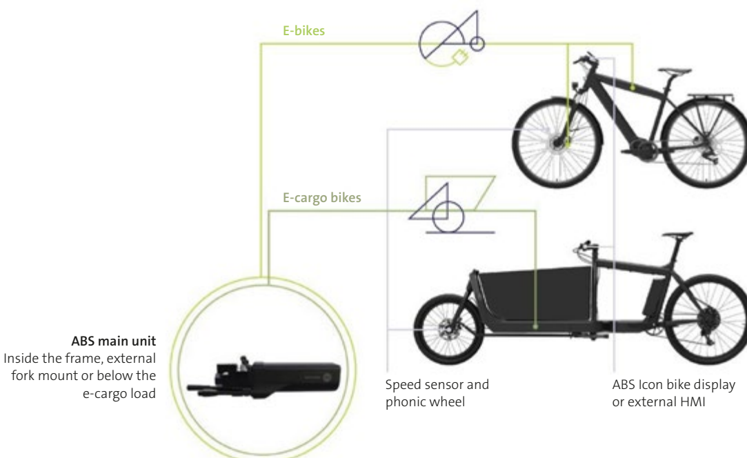
Figure 1: Components of Blubrake's ABS control system

Blubrake provides the only “open-platform” ABS system powered by a mechatronic system currently available in the e-bike market. This can be fully integrated inside the bike frame and can drastically increase safety for all types of e-bike. The overall technology is both a hardware and a software system. The hardware includes sensing devices and actuators which allow the wheel to read the road and send a signal to the AI-powered system. The software includes AI that elaborates the signal and sends the controlled